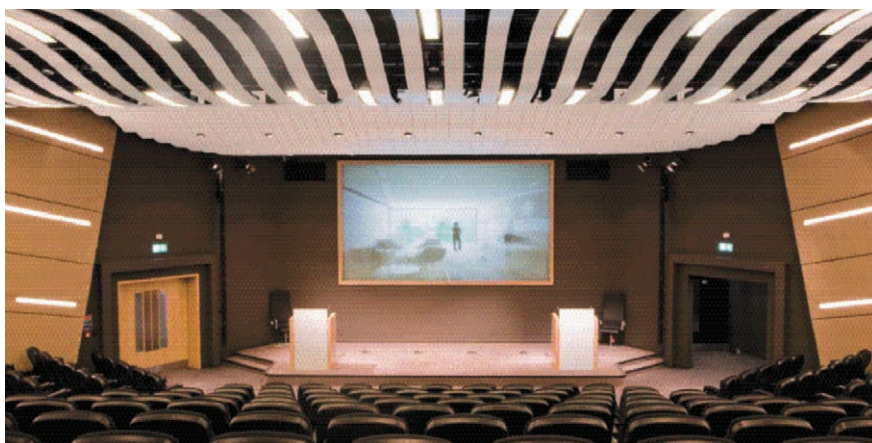
Conference Centre at AstraZeneca, Alderley Park, Cheshire

As the turn of the year rapidly approaches, it is that time again when those readers of Chromatography Today who are members of The Chromatographic Society will hopefully be digging into their pockets to fork out their membership for yet another year. There might be a few out there who are not members. Think about it 2010 could be the big year when you decided to commit yourself to supporting the Society in its mission to promote the development of separation science and, more importantly for you, take advantage of the many benefits conferred upon you through membership. There will be plenty said throughout the year on the different benefits but first it's worth looking at the primary activity of the Society i.e. organising topical, relevant symposia in separation science. Usually we are talking about four such meetings every year and you just need to attend one and you have more than paid for your membership with the discount from the members' registration fee. Just e-mail chromsoc@meetingmakers.co.uk for a membership application form!